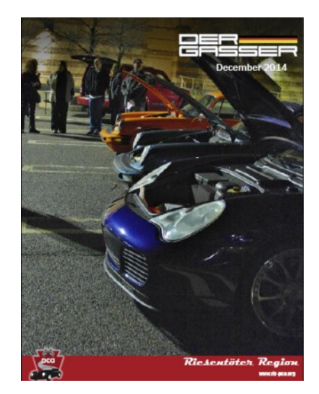
Phil-A-Frunk Event