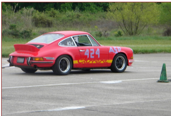
Nick with the Red Eye Special