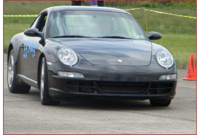
Larry Durlofsky on track